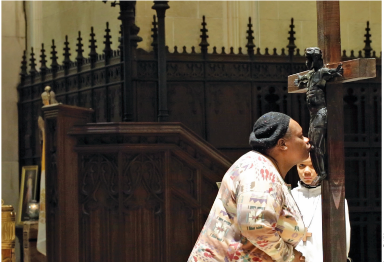
The cross used for the Adoration of the Cross is to be of appropriate size and beauty. The procession should provide space for each person to touch the cross.

Once the candle is prepared and lit, a thurifer leads the deacon or other minister, who carries the Paschal candle to the sanctuary in the darkened church. The glow of this candle pierces the darkness of the night. It is Christ bringing light into the darkness of sin and death, bringing illumination into the world. The potency of this symbol is tied into beginning the Easter Vigil after sunset.