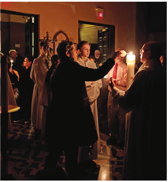
Candles are lighted from the Paschal candle after it has been raised up a second time during the procession on the Easter Vigil.

A concluding procession or recessional is not indicated in The Roman Missal (RM), but somehow the ministers have to leave the sanctuary (Order of Mass, 145). Most parishes have found