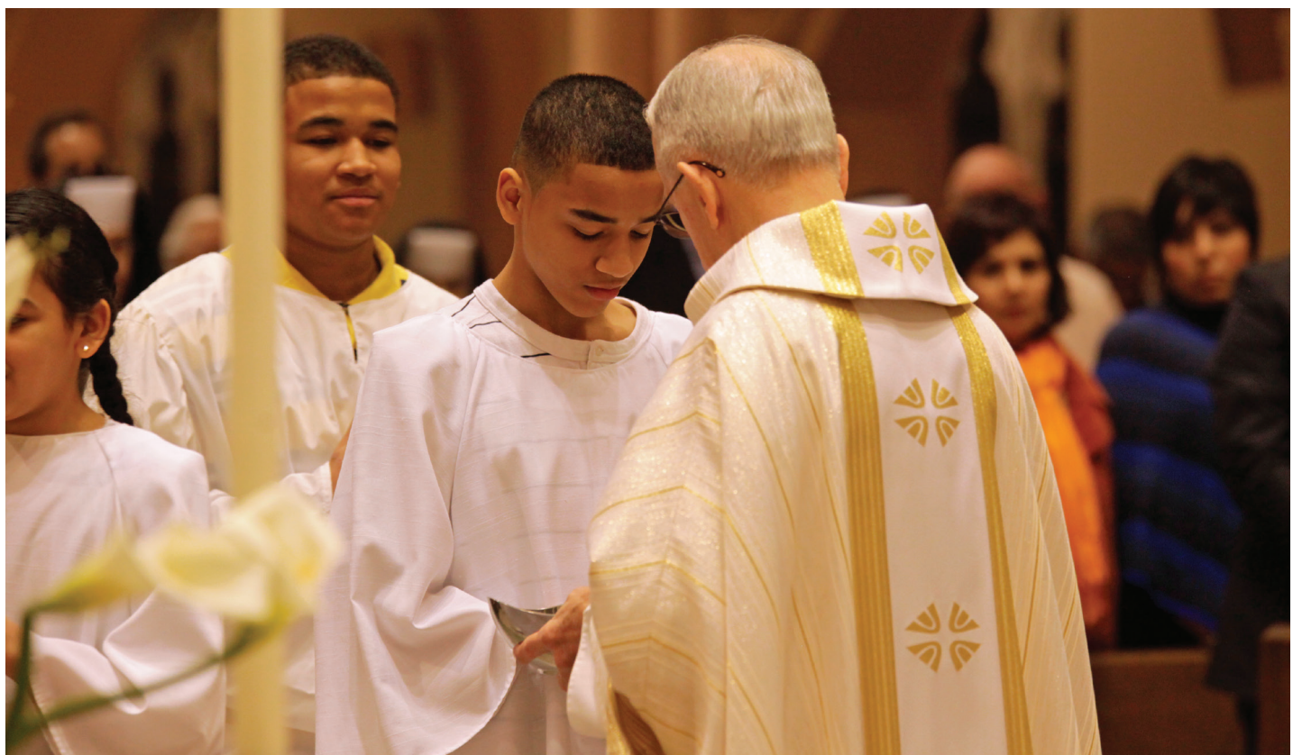
The seating of the newly initiated can ensure that they will be the first in the procession to receive Communion.

font as an important destination. Does a procession enhance the moment, or is it unwarranted?