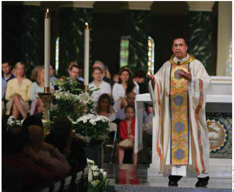
The Homily explains an aspect of Sacred Scripture or another text from the Mass. Those texts include the prayers of the Mass.

The liturgical scholar Josef Jungmann explains that the position and purpose of the Homily—following the Scripture and explaining what has been proclaimed—corresponds to the