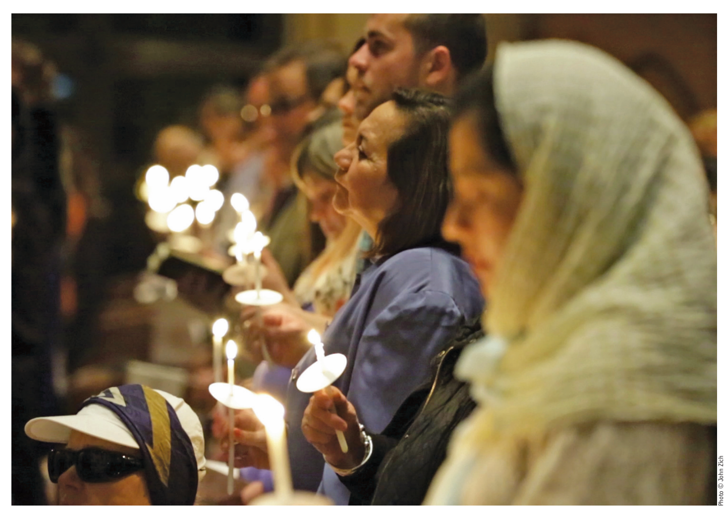
Gathering the scattered community and experiencing death and resurrection together enriches the sacred three days.