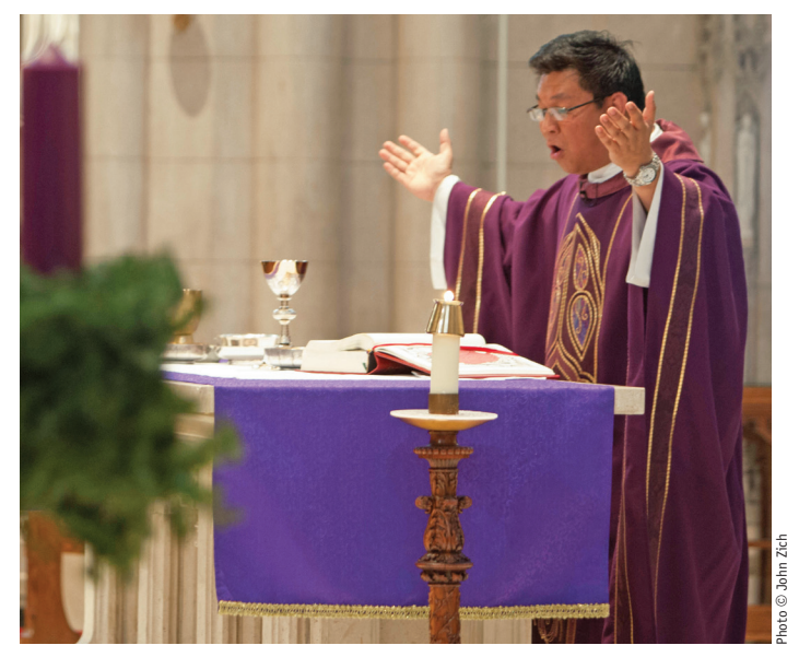
As of the First Sunday of Advent, only one edition of the Misal Romano is to be used in the United States.

In the sixteenth century, with the Council of Trent, the priest celebrated the Mass of Pius V, also known as the Tridentine Mass, with a new missal. Several editions of this missal were promulgated between the fourth and the twentieth century, with the last edition that of Pope John XXIII in 1962.