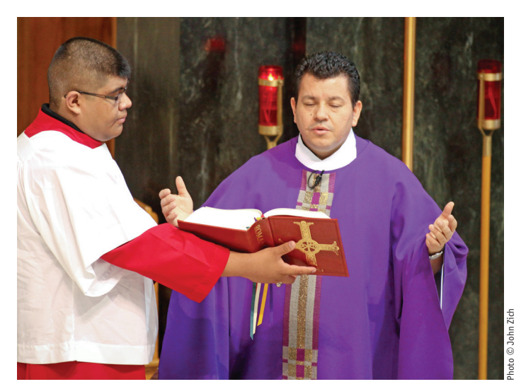
Unlike prior editions of the Misal Romano , music accompanies the text of the Order of Mass and each of the prefaces.

Easter Vigil, Ascension of the Lord, Pentecost, Masses with adult Baptisms, and Masses with First Communions), invitations before the Lord's Prayer, and invitations before the Sign of Peace. Unlike the English translation of the missal, the Misal Romano to be used in the United States includes the Rite for the Blessing of Oils and the Consecration of Holy Chrism in appendix VIII.