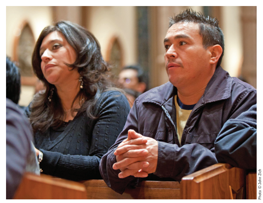
Besides a change to the words of a Memorial Acclamation, the faithful will notice few changes to their responses.

All of the optional formulas for the priest remain, but these have been moved to appendix VII. These alternative texts are: greeting formulas, invocations for the Penitential Act, both with their options for Ordinary Time, Advent, Christmas, Lent, and Easter; acclamations after the Gospel, invitations before the Prayer over the Gifts, diverse formulas for the Eucharistic Prayers (Holy Thursday, Sundays in Ordinary Time, Christmas, Epiphany,