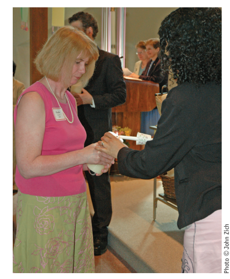
For the intent of Co-Workers to be realized, the authorization process should be strengthened with ritual celebrations.

The bishops' documents referenced in this article name lay ecclesial ministry as a gift to the Church, a gift of the Spirit. The words of St. Augustine could be a directive for us: pray as if everything depends upon God praising and thanking God for this gift of the Spirit; work as if everything depends on you—striving to guide and support the continued development of lay ecclesial ministry.