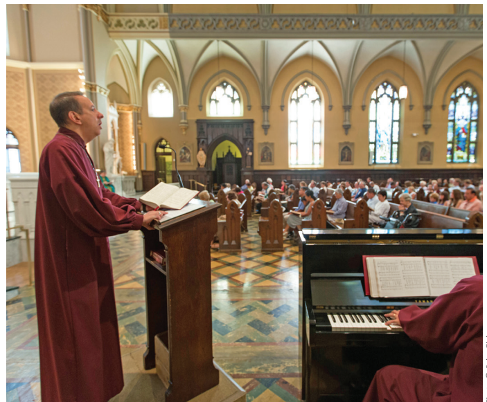
The term lay ecclesial minister has theological import in that it names the ecclesial work done by a lay person.

In various collaborative efforts, these groups have done much to enrich the understanding and practice of ministry