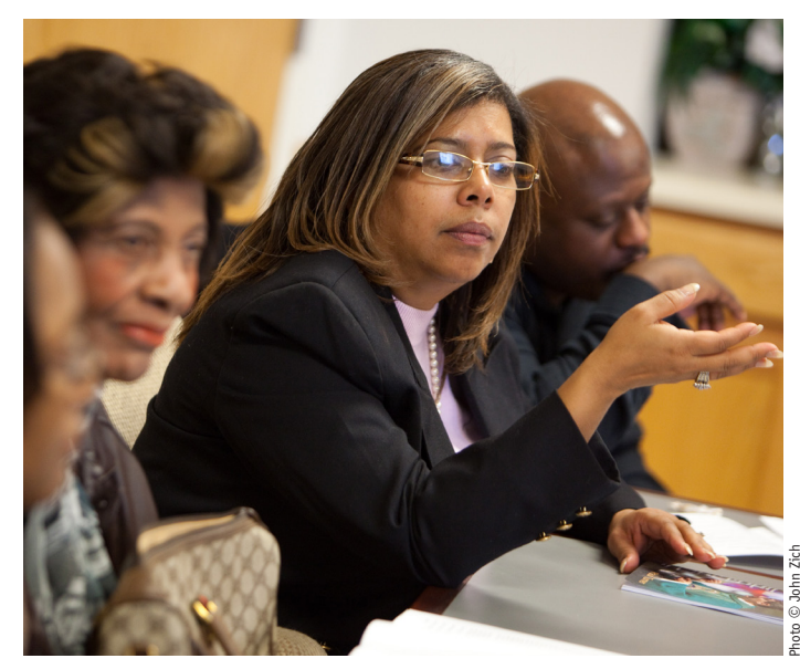
Dialogue with bishops, leaders of professional organizations, and other lay ecclesial ministers may further the goals of Co-Workers .