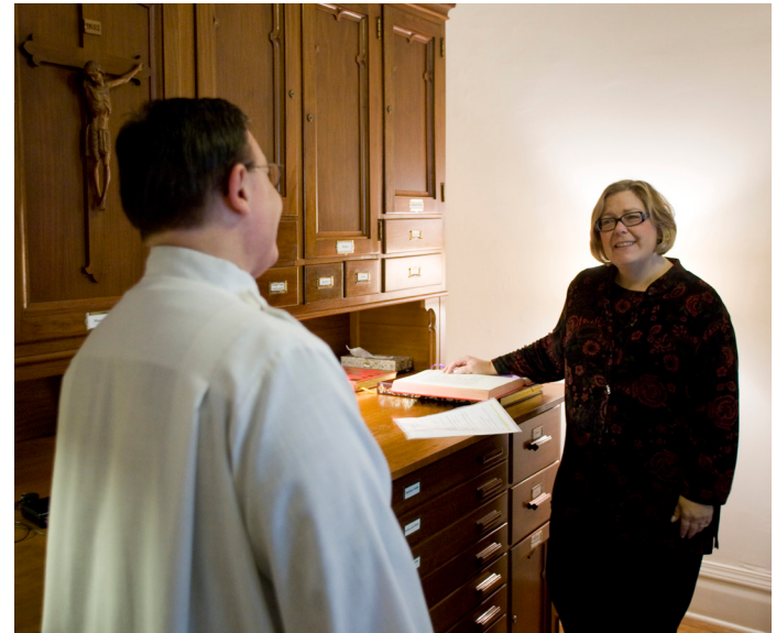
Co-Workers identified lay ecclesial ministers as those who possess a significant degree of preparation, formation, and professional competence, with responsibilities or leadership in areas of ministry and who work in collaboration with the pastoral ministry of bishops, priests, and deacons.