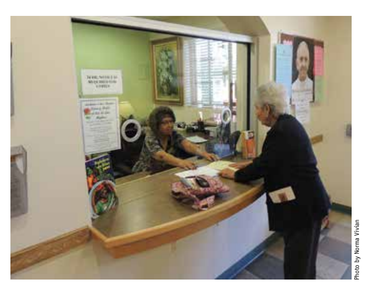
As the first contact for individuals interested in the parish, office staff set the tone of welcome and hospitality.

beloved Christmas and Easter Catholics and to all on the fringes of our Church who think they have no home here. I need to stretch my ears further to those outside the Church, our Christian brothers and sisters in other denominations, to our Jewish and Muslim neighbors and those of all faiths. I must listen to agnostics and atheists as well. I must listen to those on the margins and hear the cry of the poor and oppressed.