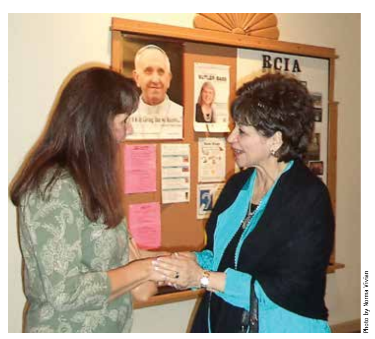
Hospitality includes listening to the story that individuals bring and responding with compassion.

other faith communities, in community organizing for the common good. Concerns of late have especially focused on public education in New Mexico, on employment opportunities, and on fairness for immigrants.