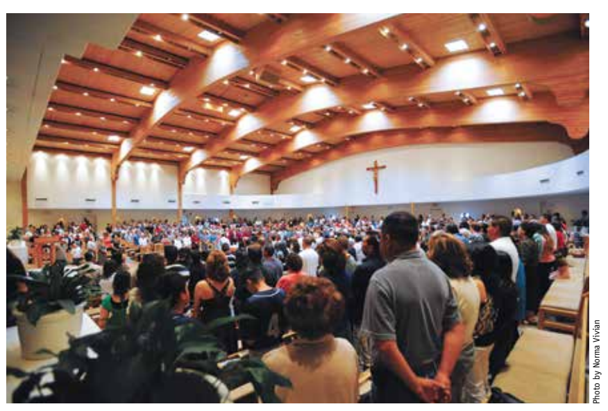
Spanish and bilingual liturgies as well as bilingual bulletins, apps, and hospitality events after all liturgies help all to feel included.

What is the reaction to this additional step in parish registration? Generally, the reaction is very positive. People are attracted to Holy Rosary because it is seen as a welcoming community, and this process is an opportunity for a one-on-one encounter with a person who genuinely cares. It's an opportunity to learn more about the parish and to possibly become involved in ministry. It's also an opportunity to begin a pastoral approach to issues that might need resolution.